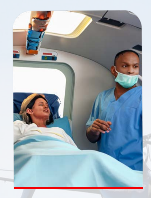
Offering Advanced Technologies and Strategies for swift medical intervention and saving lives