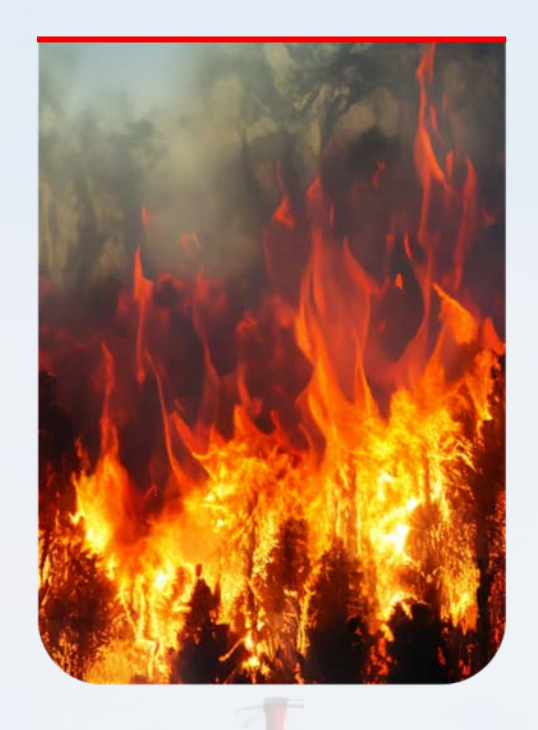
Providing Innovative Solutions to combat Forest fires and mitigate global warming