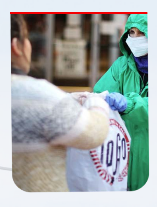
Supporting Governments and Organizations in preventing and managing pandemics effectively